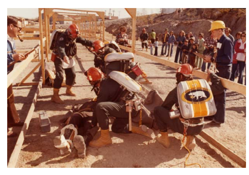
Running the course, 1978.

with a modern version. But the important tradition of mine safety continues and remains an invaluable and cherished aspect of the northern mining industry.