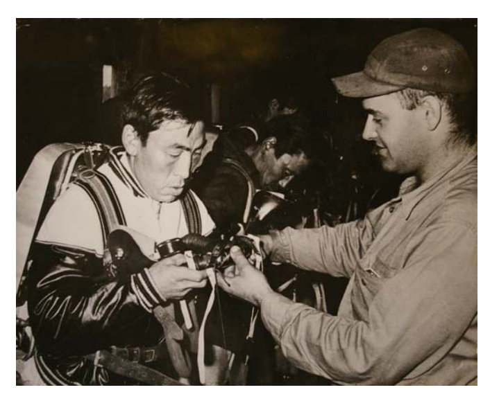
Training Inuit workers at Rankin Inlet nickel mine, 1961.

The first competitive event was held the following year on September 7<sup>th</sup> 1957 between the three gold mines. This was a semi-final event. The winners, Giant Mine, then traveled to Port Radium on Great Bear Lake on September 21<sup>st</sup> to compete against the Eldorado Uranium team, winning that test as well. Giant's team was the first NWT champion of mine rescue in 1957.