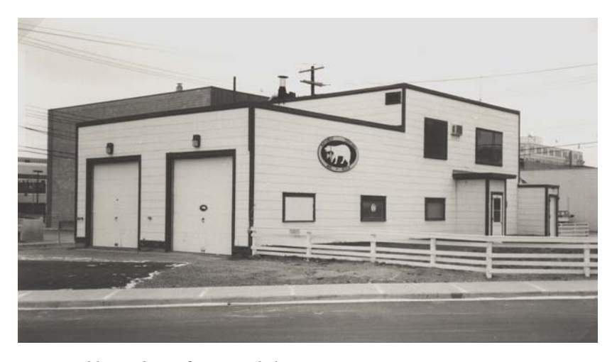
Yellowknife's old Mine Rescue Station, where the Side Door Youth Center is now.

Mining inspectors Steve Homulos and Geddes Webster hammered-out the important document, setting standards on how northern mines should operate. Before that, mines relied on the safety methods applied in jurisdictions such as BC and Ontario, which although excellent practice, did not always apply to northern issues. The NWT's own safety act was an important step both legally and functionally.