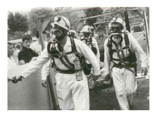
NWT Mine rescue team in national competition, 1967.

an apartment for the mine rescue superintendent and his family.