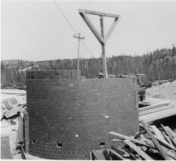
Figure 2: Roaster stack construction, 1953.

The new Dorrco roaster was also plagued with problems, highlighted by several breakdowns including an explosion during startup, and a significant deficit in gold recovery. These were serious problems because the mine was proceeding with an expansion program that hinged entirely on the success of the treatment plant. Roaster temperatures were not as high as