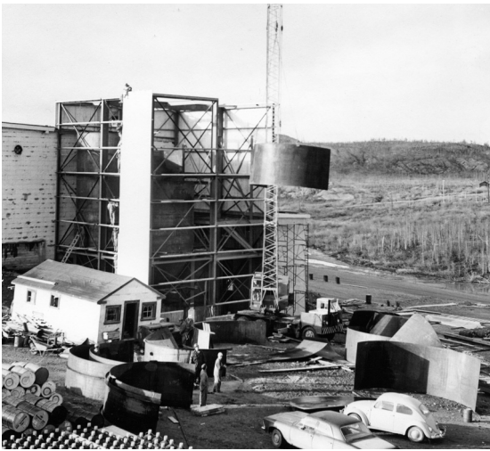
Figure 4: Construction of the sand plant mill addition, 1956.

The main treatment plant (or mill) was built in 1947-1948. The mill was built on a natural slope of bedrock and was pinned on a concrete foundation. During initial construction in 1947, space for future additions were reserved by blasting foundation rock so as to not disrupt operations – this addition was completed in 1952 to double the size of the treatment plant. The substantial structure was wood framed and shiplap sheathed, covered over in a fireproof asbestos tarpaper. Wood was the only material then available to build such a massive superstructure. Giant Mine operated a sawmill on the Slave River where much of the rough lumber for construction was harvested.