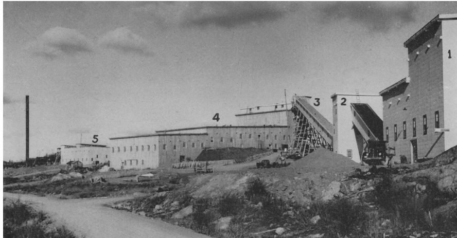
Figure 1: Treatment plant 1948-1949. 1) crusher, 2) screen house, 3) conveyor gallery, 4) grinding and cyanidation plant, 5) original Allis Chalmers roaster and stack.

With the discovery of schist shear zones in 1944, it was clear that the complex ores of ultra-fine gold and associated sulphide minerals would require special handling to achieve optimal recovery. Ores were tested at the Bureau of Mines in Ottawa and at Nepheline Products in Lakefield, Ontario. Lab tests revealed that less than 20% of the gold could be extracted using mercury amalgamation and less than 33% by direct cyanide treatment. The most practical method using technology then available was to produce a sulphide concentrate through a gravity-flotation process, break the gold free from arsenopyrites through autogenous roasting, and then cyanide the calcine produced by the roaster.