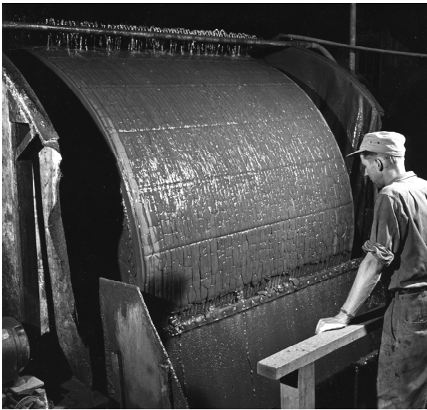
Figure 8: Drum filter separating waste from pregnant solution.

The calcine washing process removed excess acidic water and increased the slurry density for subsequent cyanide leaching. Roaster calcines were water quenched and reground in a ball mill in closed circuit with cyclone classifiers. Regrinding the slurry broke down the size of the iron oxides contained in the roaster calcine, further exposing the contained gold. The solution was then thickened (dewatered) and filtered, with cake repulped in fresh water and reground in a second ball mill with cyclone before reporting to the main cyanidation plant, located in the main treatment plant.