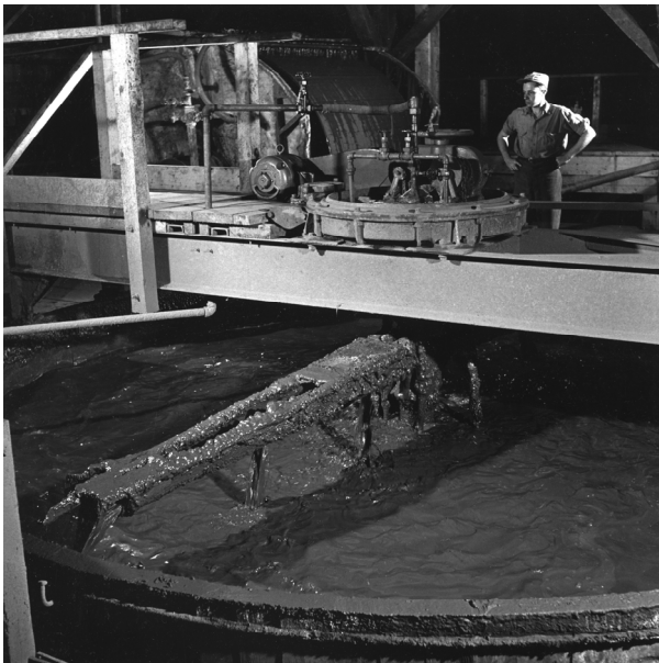
Figure 7: Thickener where solution was dewatered with cyanide.

The flotation concentrate was pumped from the main treatment plant to the roaster complex where it was blended, agitated, thickened and filtered to achieve consistency in assay grade and pulp density. Slurry was fed into the Dorcco first-stage roaster by a low-pressure feed gun positioned near the top of the vessel tank. A 5,000-cfm blower supplied air to the first stage for fluidization and to support autogenous roasting (the sulphur in the ore oxidized generating the heat to fuel to process). Air entered a windbox through nearly 200 tubes (tuyeres). The first stage reactor was commonly called the arsenic elimination stage. The arsenic contained in the arsenopyrite was partially oxidized at elevated temperature (500°C) driving off the sulphur as gaseous sulphur dioxide.