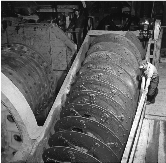
Figure 5: Grinding circuit with ball mill and spiral classifier.

The main treatment plant (or mill) was built in 1947-1948 with an expansion to double its size built in 1952. In this structure, the ore was treated to initial grinding and flotation. The solutions were then pumped to the roaster, and the gold-bearing calcine was pumped back to the mill structure for cyanidation and precipitation. Giant was unique because of the need to frequently change the treatment process in its early experimentation period. There was little foresight or vision to create a compact flowsheet. Getting out the gold was the prime objective, and a visitor to the mill in later years would have a hard time following the flow of the gold solutions through the complex. A slurry tank designed for one purpose might be re-piped for another purpose, and then changed again. By the time Giant had figured out the best treatment strategy, the plant was a confusing maze of process pipes and tanks. And yet there was a highly skilled group of men (and later women) who knew the process like the back of their hand, and at least one fellow who has worked at Giant for over 45 years claims to know every pipe joint in the place.