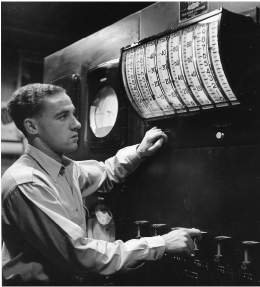
Figure 10: Albert Hall with roaster temperature monitor.

on the hill above Giant Mine. Six large steel agitation tanks made up the bulk of the facility, a structure that can be seen miles away in Yellowknife's Old Town. It was monstrous both in sheer size but also in the cost, with a price tag of $15 million. The plant ran for three summers (1988-1990), processing three million tons of old wastes, but producing only 49,000 ounces of gold – far short of expectations. The T.R.P. is sometimes called 'Peggy's White Elephant' referring to Royal Oak president Peggy Witte; however Royal Oak bought the Giant Mine from Pamour in 1990 and had nothing to do with the construction of the T.R.P. – in fact, Royal Oak made the decision to shut down the unprofitable plant in 1990. (Giant Yellowknife Mines Limited Annual Reports, 1986-1990)