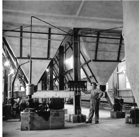
Figure 9: Cottrell plant in the roaster complex. Lloyd Ross, mill foreman, at the controls.

Refining was conducted using two oil-fired furnaces to produce gold bullion bars containing about 75% gold, 20% silver, and remaining impurities. In the 1960s, the mine was pouring between six and eight gold bricks per day. Each bar typically contained between 800 to 900 ounces of gold and could weigh up to 70 pounds.