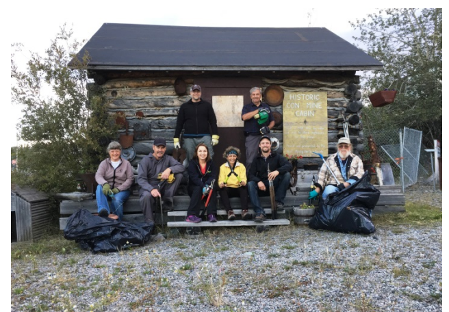
Volunteer work party August 2018