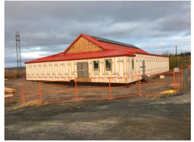
Museum construction August 2018

Yellowknife Historical Society Box 1856 Yellowknife NT X1A 2P4 www.yellowknifehistory.com info@yellowknifehistory.com