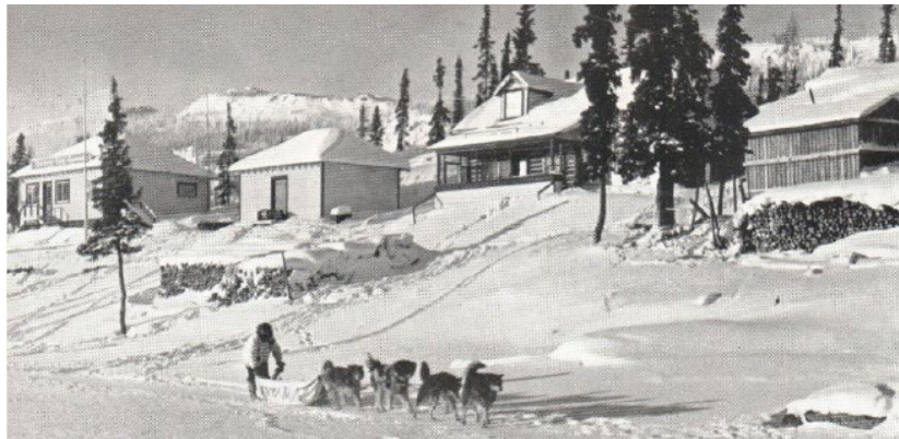
Cameron Bay – precursor boom town to Yellowknife