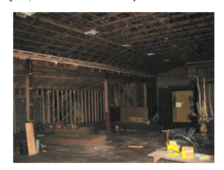
Interior work in rec hall

This years work was aimed at maintenance of the entire museum site, to ensure that our various buildings will last for years to come. More work is required on the recreation hall, our proposed main exhibit space. Interior gutting is only the first stage in redevelopment of the facility, and the Society will be fundraising for the additional capital necessary to finish the museum project over the next year.