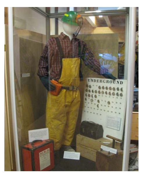
Dress like a miner at the mining exhibit at Prince of Wales, running until August.

skyline in the NWT as we lose more of our mining heritage.