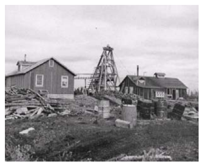
Thompson-Lundmark gold mine, Kim shaft 1939.