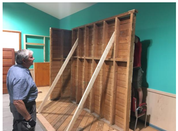
Volunteers move display cases and build exhibits